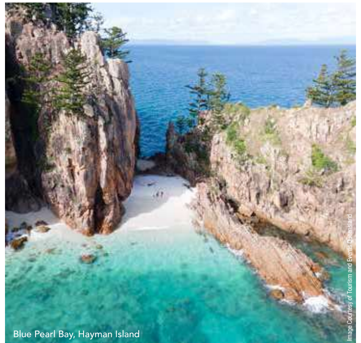
Blue Pearl Bay, Hayman Island

Meals: Breakfast and Lunch with Beer, Wine and Soft Drinks