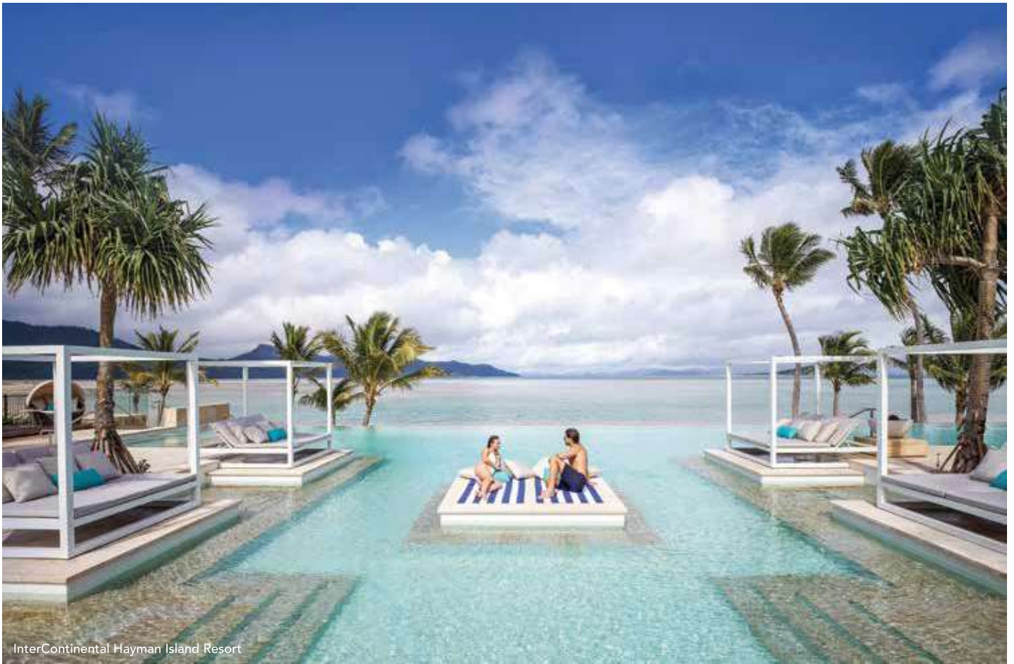
InterContinental Hayman Island Resort