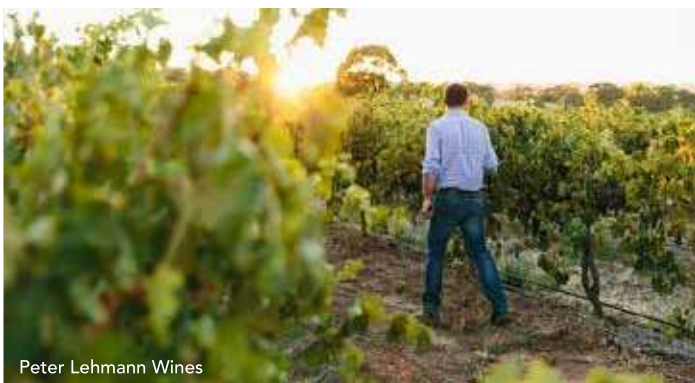
Peter Lehmann Wines

Meals: Wine Tastings and Dinner with Paired Wines