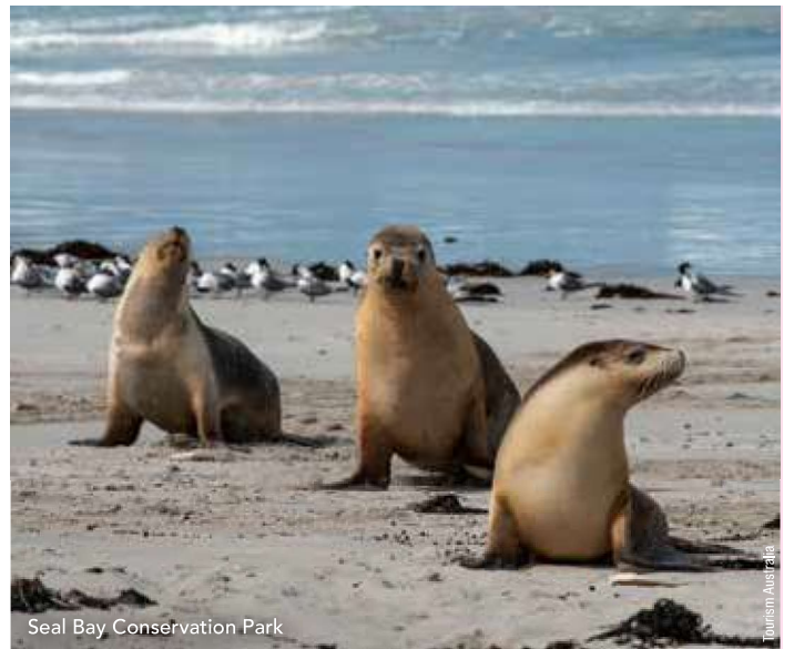
Seal Bay Conservation Park

Meals: Breakfast, Lunch with Wine and Dinner with Beer, Wine and Soft Drinks