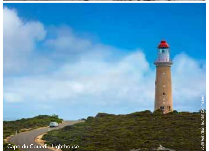
Cape du Couedic Lighthouse