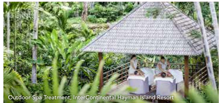
Outdoor Spa Treatment, InterContinental Hayman Island Resort