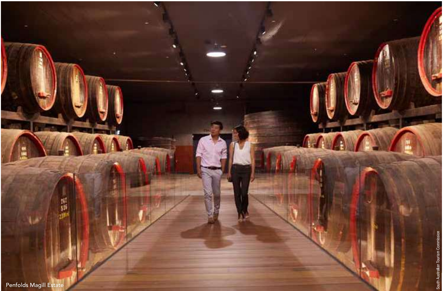
Penfolds Magill Estate