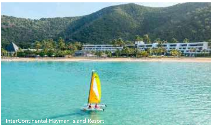
InterContinental Hayman Island Resort