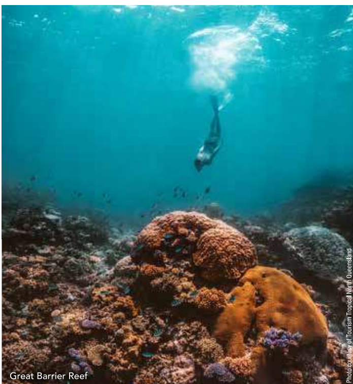
Great Barrier Reef