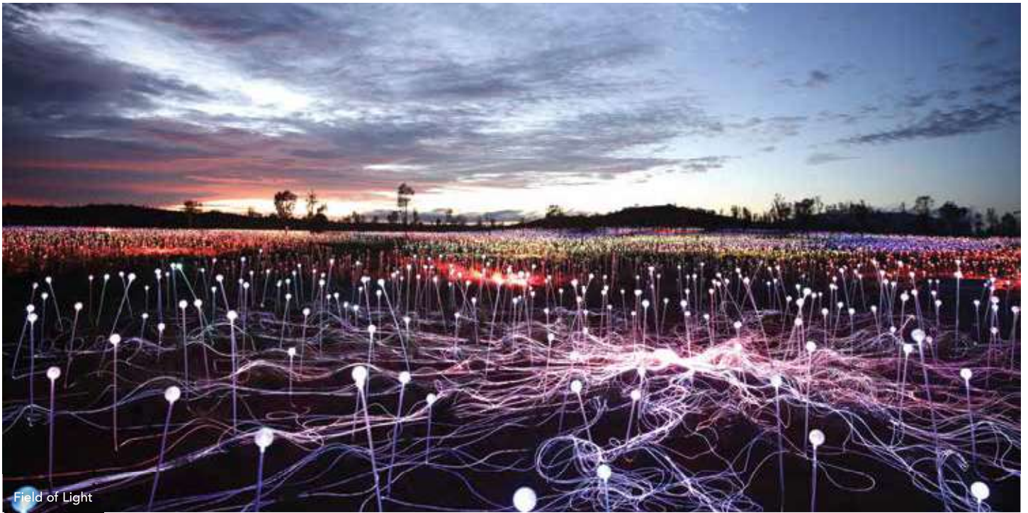
Field of Light